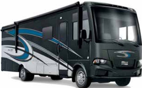
BAY STAR SPORT