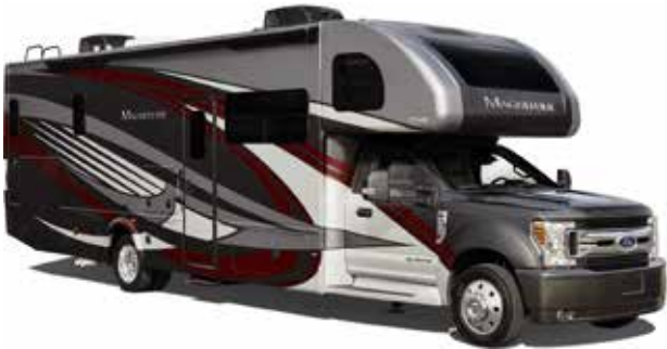
MAGNITUDE SUPER C