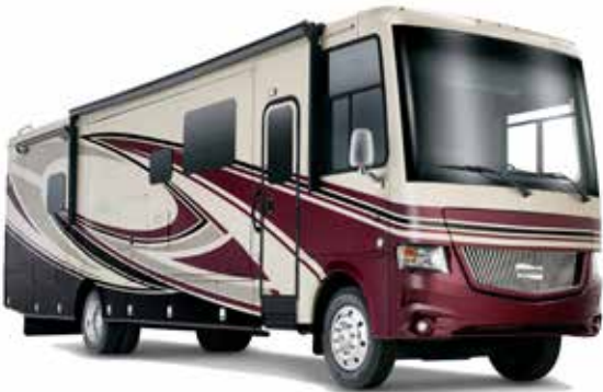
CANYON STAR *FRONT ENGINE DIESEL*