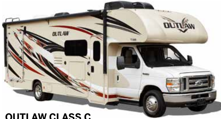
OUTLAW CLASS C